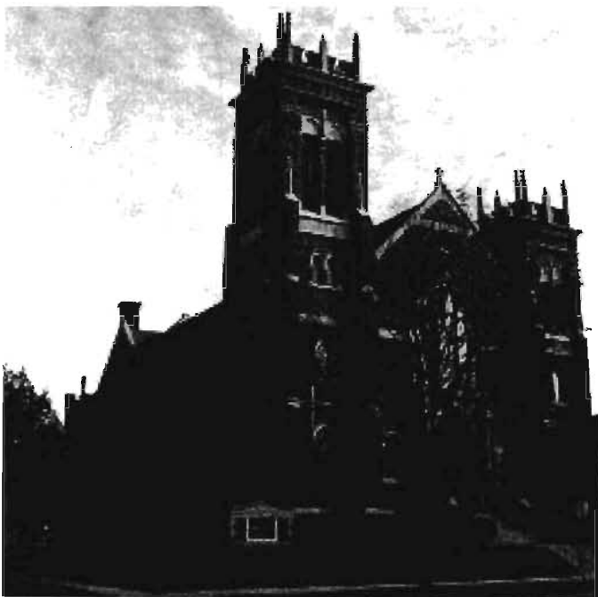
St. Paul's Evangelical Lutheran Church, Saginaw, Michigan

I view these plantlets with special affection, since God transplanted them and the Lord put them in my care. The whole festivity left a deep impression on the numerously gathered congregation.